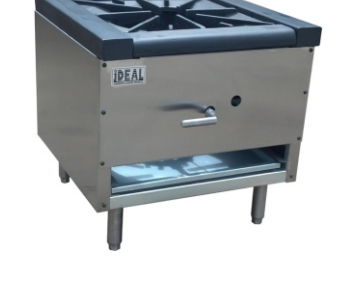
Jet (Mandarin) Ranges