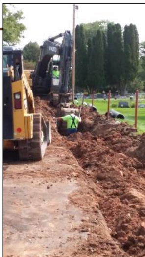
They recently dug and placed the drains from the retaining pond out to Portage Road.

Things continue to progress with the construction at church. We are in our final stage with plans to have everything finished by mid December this year.