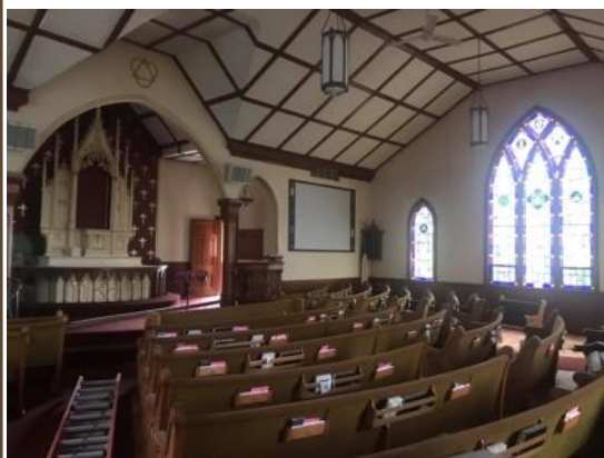
The best part is that the boards are off the stained glass windows!