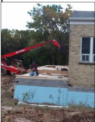
Construction has begun on the sacristy on the back of church.

Soon the parking lot will be finished, sidewalks installed and retaining walls placed.