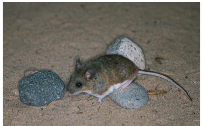
Fig. 1. — Peromyscus guardia from Estanque Island. This is probably the last known specimen.

Townsend (1912) described Peromyscus guardia (Fig. 1) as being larger in overall size than P. eremicus (cactus deermouse) as well as being as least as pale in coloration. It is possible that all (or some) of the specimens of eremicus