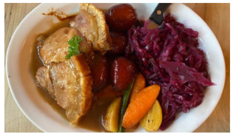
Roast pork, crackling, caramel potatoes, red cabbage, vegetables

Operators Mark Mogensen and Darrin Mascarin continue to battle the fallout from Covid-19, which still impacts