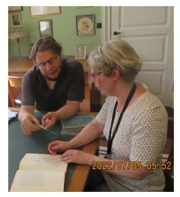
Authenticating the book in the old office of Niels Bohr at the Niels Bohr Institute