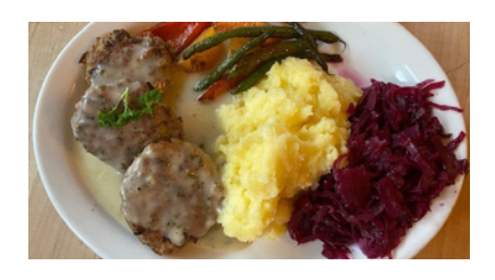
Frikadeller, mashed potatoes, red cabbage and vegetables

Renowned for it's smorrebrod, it's time to also come back to The Danish Place to get your Danish dinners! Feedback and changes to the menu at The Danish Place have resulted in more Danish dishes, just like Mor Mor would make! Consider coming for the Tarteletter, Frikadeller, Roast Pork or Filet of Sole with parsley sauce, Citron Fromage (lemon mousse), Meringue Cake, Lagkage (layer cake) or Aeblekage (apple trifle).