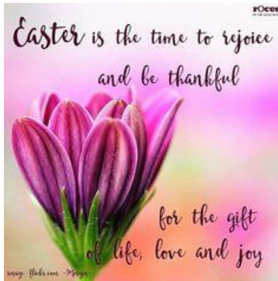
April's Gratitude Image from Maureen Hughes