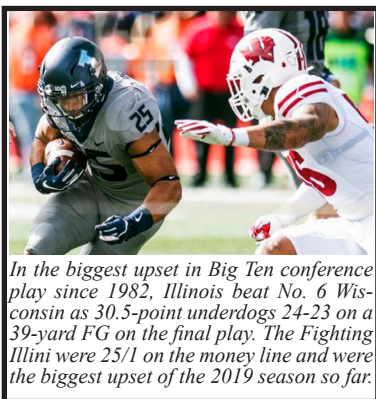
In the biggest upset in Big Ten conference play since 1982, Illinois beat No. 6 Wisconsin as 30.5-point underdogs 24-23 on a 39-yard FG on the final play. The Fighting Illini were 25/1 on the money line and were the biggest upset of the 2019 season so far.