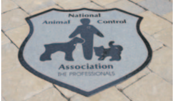
In October, the National Animal Control Association opened the Memorial Wall and Gardens, a permanent tribute honoring animal control officers who have died in the line of duty.

felony, equaling the protections for other law enforcement officers. This bill has the support of the Ohio County Dog Wardens Association for recognizing the dangers that all animal welfare professional face when performing their duties.