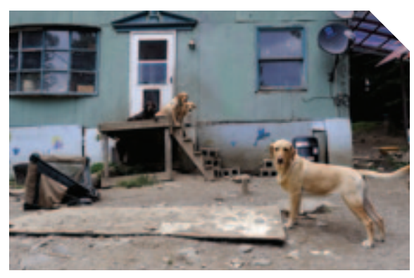
While the public envisions animal control officers' work as simply rounding up stray dogs, the reality—and the dangers—are much more complex.

Unlike information on the deaths of police officers or firefighters, the records for animal control casualties have