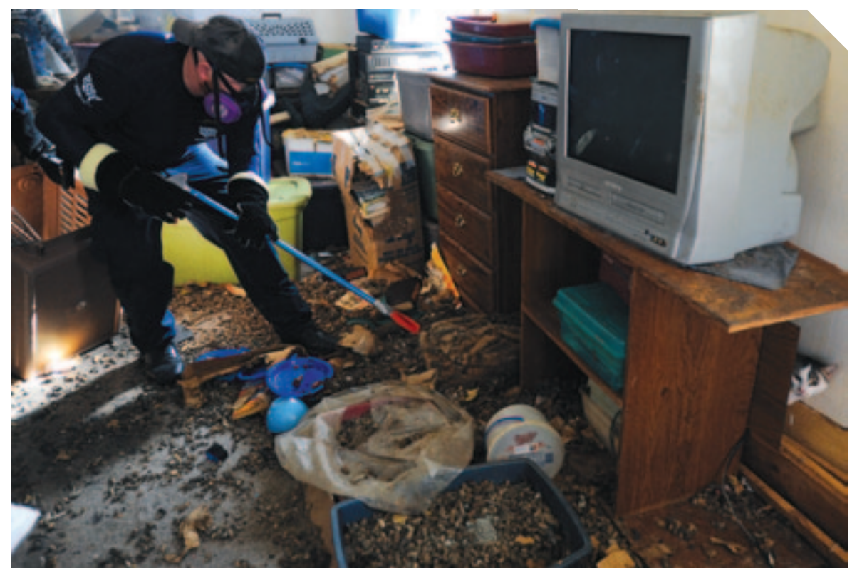
In their dayto-day work, field officers can encounter dangers that range from fractious animals to the environmental and health hazards that can accompany a severe hoarding case.