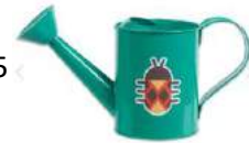
#SC609 Kids Watering Can $9.95