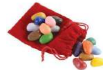
#A275 Crayon Rocks $9.95 (would like 2)