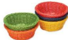
#K101 Colored Plastic Basket Assortment (set of 5) $26.95