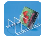
#X208 Small Multi-Purpose Organizer $5.95