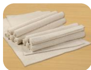
#GC07 Work Rug Assortment (set of 12) $147