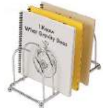
#X720 Toast Rack $9.95