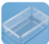
#B106 Clear Plastic Box $4.75 each (would like 2)