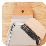
#Q12 Small Crumb Set $9.95