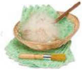
#PL14 Dusting Activity $18.95

The Giving Tree is a longstanding tradition at Sunrise. Some of you may have noticed the Giving Tree displayed on the wall in our front room during Visiting Day. The tree is decorated with colorful leaves that are now filled with Classroom Wish List Items chosen by the teachers. The Wish List items are available for families to purchase and donate to your child's classrooms at any time throughout the year. There are various items to choose from, and these are typically listed in the Montessori Services catalog for viewing. If anyone is interested in purchasing something for the school, you may view the list that accompanies this newsletter or visit our school website (Parent Corner page) anytime. Once you have chosen your donation item, please send in the name of the item with a check for that amount, payable to Sunrise Montessori School, Inc. Donation receipts are available upon request.