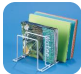
#X209 Large Multi-Purpose Organizer $7.95