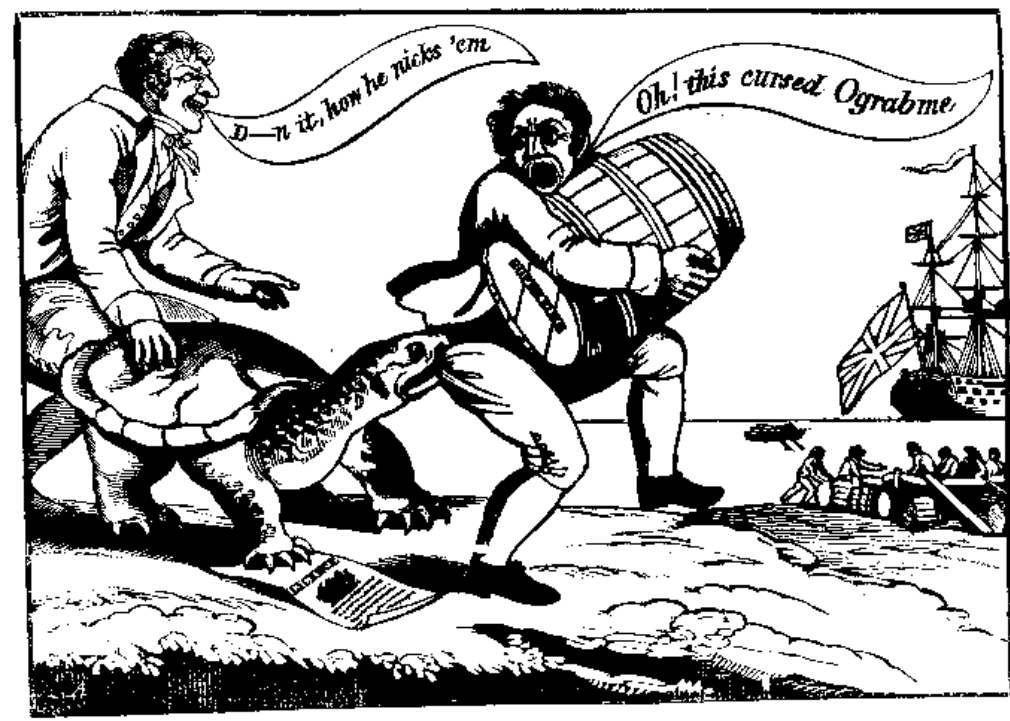
OGRABME, or. The American Snapping-turtle.

Remind students that the readers already know the documents inside and out... go beyond simple descriptions and quotes! GO BEYOND THE OBVIOUS!