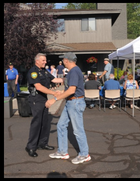
Thank you to all who participated in our National Night Out celebration!

Don't Forget... we also offer Vacation Watches, Bicycle Registration, Special Event Parking Permits, and Free Drug Disposal.