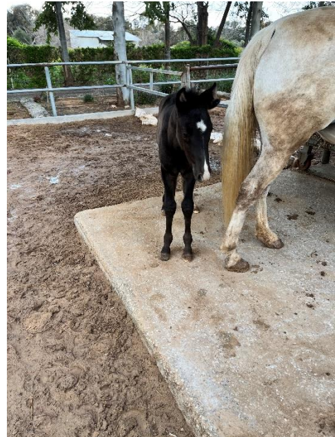
Colt by Thunder of Smokey out of Slim's Spring Twister PVF