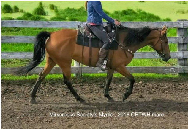
Mirycreeks Society's Myrtle, 2016 CRTWH mare