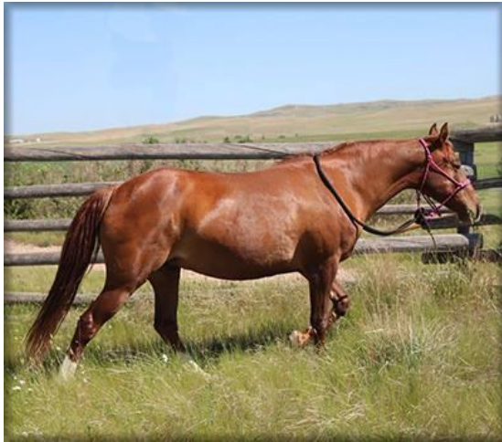
Red Bud's Bullet Serenade (Red Bud's Rambling Slim X Bud's Spring Serenade) is a Level 1 IHWHA mare that is in foal to Red Zeppelin (Rooster) for spring 2022. This foal will be for sale. "Sarah" is 14.2hh.