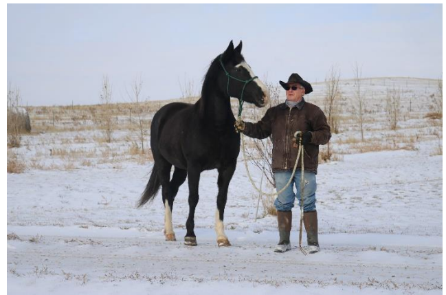
SC Just Ducky ( Slush Creeks Jubal S X Lehman's Black Dixie) is a Level 1 IHWHA black sabino mare. She is in foal for spring 2022 by Red Zeppelin. This foal will be for sale. Ducky is 15.1hh.