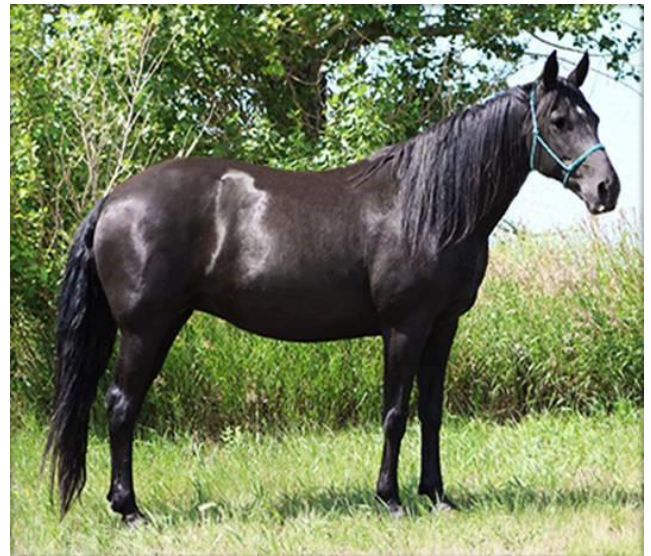
Jubals Princess Holly (Slush Creeks Jubal S X Miller's Princess) is a Level 1 IHWHA mare, she is in foal to Red Zeppelin aka Rooster for a spring 2022 foal. We will keep the foal if it is a filly but it will be for sale if it's a colt. Holly is 15.2hh.