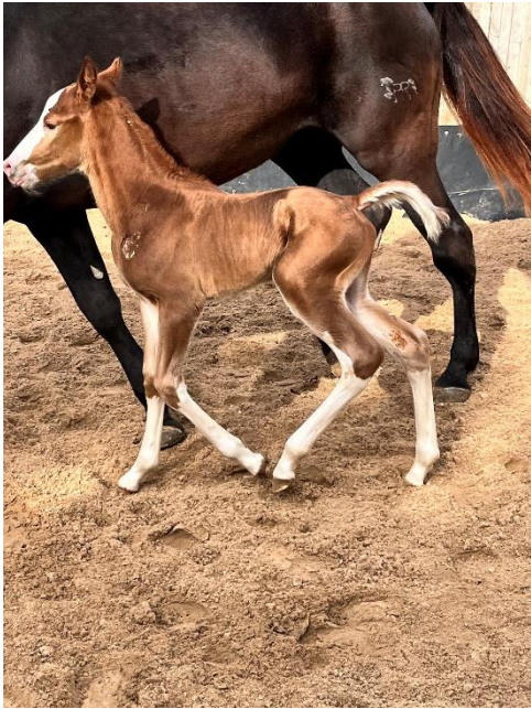
Colt sired by Societys Jeremiah Wilson, out of TC Black Belle