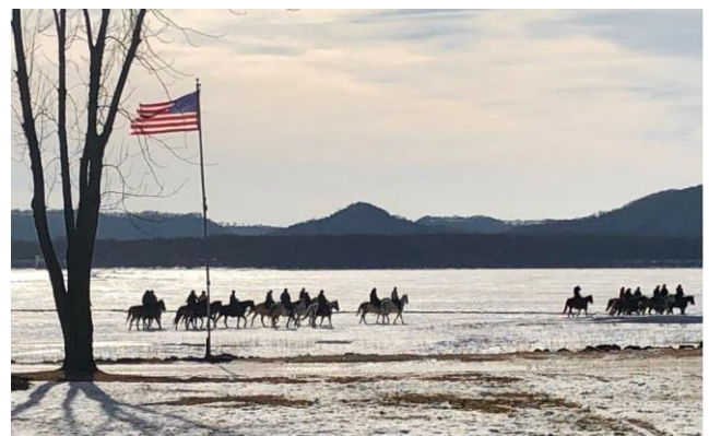
Heading back to MN shore. A beautiful February day for a ride on the water, hard water.