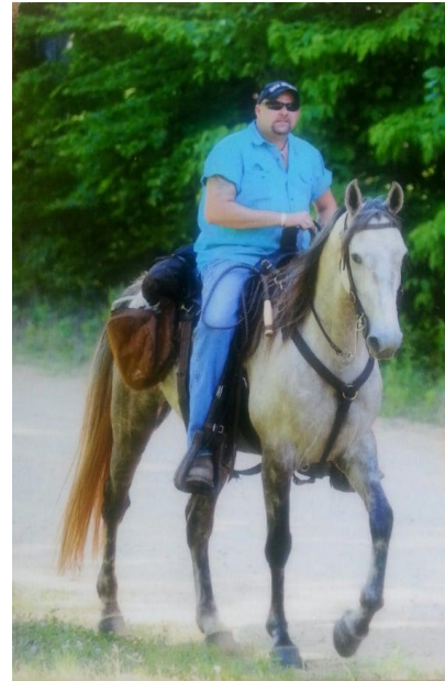
Mollie is an awesome riding mare!