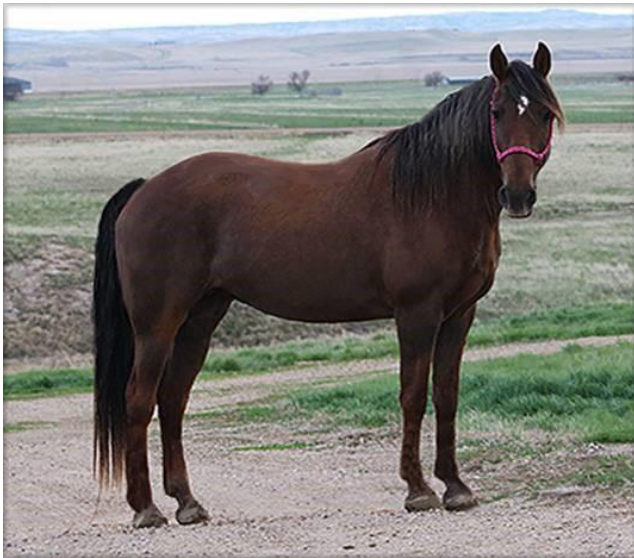
SCW The Princess Stride ( Delight's Midnight Legend X Miller's Princess) is a Level 1 IHWHA chestnut mare. Princess is in foal for spring 2022 foal by SCW Counting Cadence. This foal will be for sale. Princess is 15.1hh.