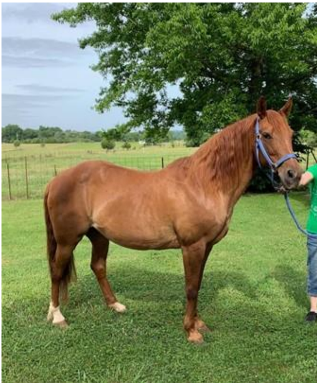
Clark’s Red Bud All Over, aka Allie

She is just a yearling but will be saddle trained when she is old enough and eventually will join the broodmare herd.