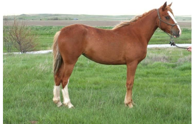
SCW Red Headed Lil ( Slush Creeks Jubal S X Lehman's Black Dixie) is a Level 1 IHWHA sorrel sabino mare. Lilly is in foal for a spring 2022 foal by Red Zeppelin. This foal will be for sale. Lilly is 15hh