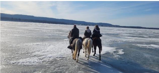
The lead trio crossing Lake Pepin.

Leaving the MN shore and heading out across Lake Pepin, a couple of miles ride to WI side. Horses didn't like the booming sounds the ice makes at first, but they soon settled down. We first did this ride in 2014, but some years the ice isn't right for safe passage! In the frontier days people rode and drove teams across Lake Pepin to shop in Lake City, MN. Including Laurel Ingalls Wilder and her family who lived in Wisconsin, back in the day.