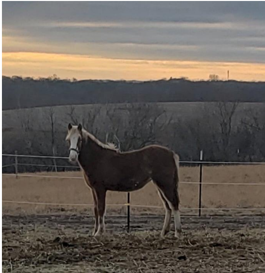
Lil Bit O’Honey

She is just a yearling but will be saddle trained when she is old enough and eventually will join the broodmare herd.