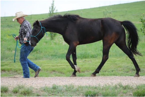
SCW Jubals Pixie Stick (Slush Creeks Jubal S X Dakota Gumdrop) is a Level 1 IHWHA black mare. Pixie is in foal for spring 2022 to SCW He's A Midnight Legend. The foal will be for sale. Pixie is 14hh.