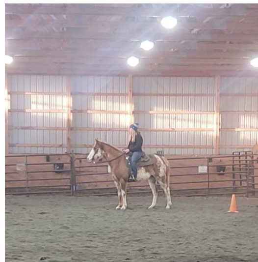
Oliver's Ginger Lee, aka, GG Gangsta