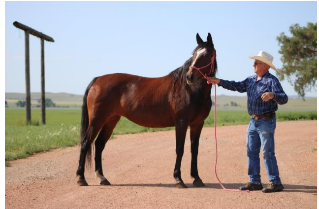
Slush Creeks Tiny Dancer (Slush Creeks Jubal S X Zephyr Good and Ready) is a Level 1 bay mare. She is in foal for 2022 to Red Zeppelin. If this is a filly we will keep it. If it is a colt it will be for sale. Dancer is 15.1hh.