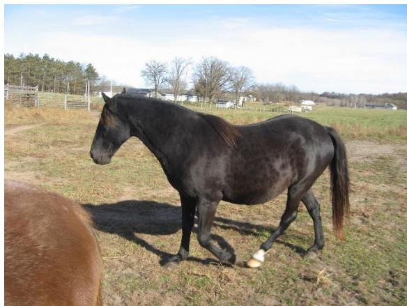
Ostella Valentine Brookie showing off her baby bump. She is in foal to Jericho. Hoping for black with chrome!!