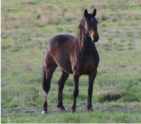
SCW Ready for Midnight (Delight's Midnight Legend X Zephyr Good And Ready) is a Level 1 IHWHA bay mare. Ready is not in foal this year. She is 15.1hh.