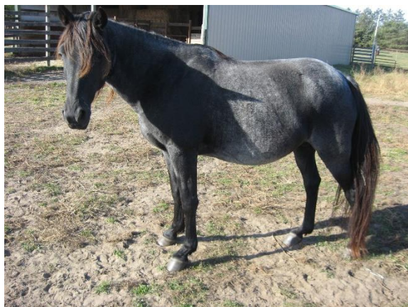
Ostella Silver Lady is in foal to Jericho. Looking forward to this one and hoping for a black classic roan!!! A black sabino would be super as well!