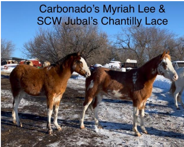
Carbonado's Myriah Lee & SCW Jubal's Chantilly Lace