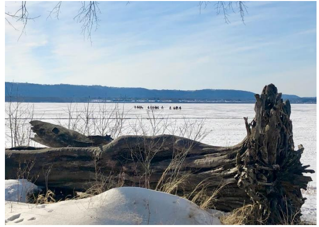
Getting close to Wisconsin and our destination.