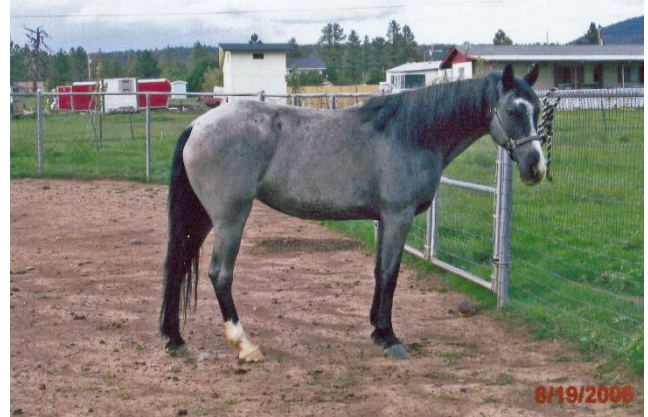
Sam’s Blue Blaze