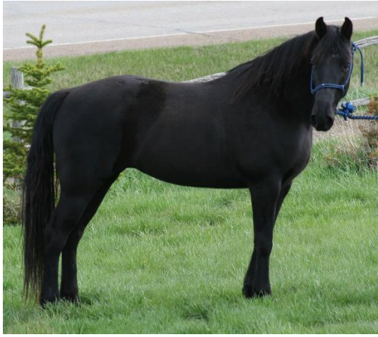
SC Ebony Silk Perfection (Slush Creeks Jubal S X Dakota Cheerleader) is a Level 1 IHWHA. Silky is not in foal for 2022. She is 15.1hh