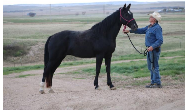
Slush Creeks Lollipop (Slush Creeks Jubal S X Dakota Gumdrop) is a Level 1 IHWHA black mare. Lollipop is not in foal for 2022. Lollipop is 15.2hh.