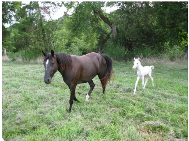
Smokey's Myriah Angel

Angel is in foal to Echo's Confederate Rebel for a late summer foal.