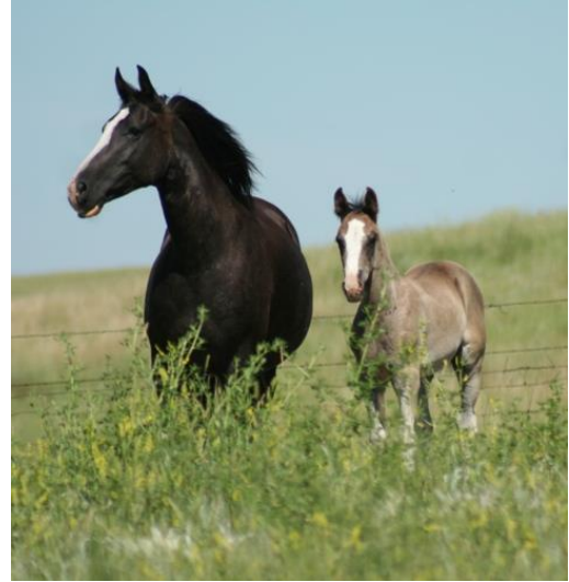
SC She's Simply Stunning ( Slush Creeks Jubal S X Ebony's Country Charm) is a Level 1 IHWHA black sabino mare. She is in foal for spring 2022 to Red Zeppelin aka Rooster. The foal will be for sale. Hiss is 15.3hh.