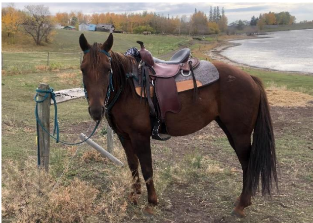
LL's Ginger Spice