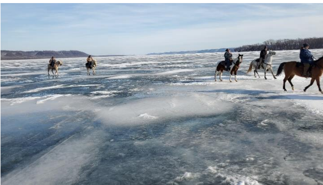
Ice was clear in places, 15-20" thick