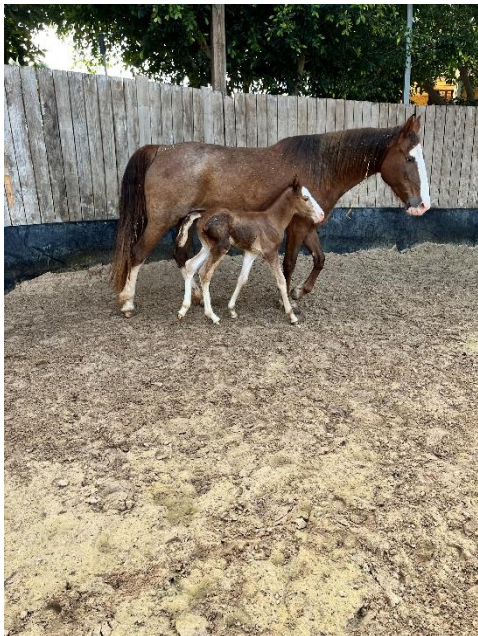
Colt sired by Society's Moonstone out of Carbonado's Stellar Moon