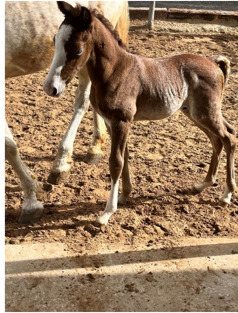
Colt sired by Thunder of Smokey, out of Ostella's Diamond Ann