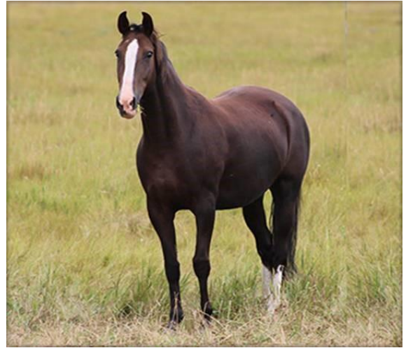
Northfork She'za Legacy (Walkien Jesse Skywalker X Summer Penny) Level 1 is in foal for a spring 2022 foal by SCW Counting Cadence. This foal will be for sale. Legacy is 15.1hh