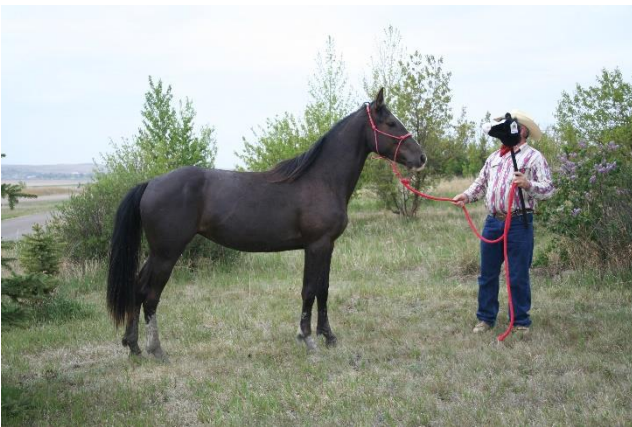
SCW Delight's Zephyr (Delight's Midnight Legend X Zephyr Dakota Breeze) is a Level 1 IHWHA black mare. She is not in foal this year. She is 15.2hh.