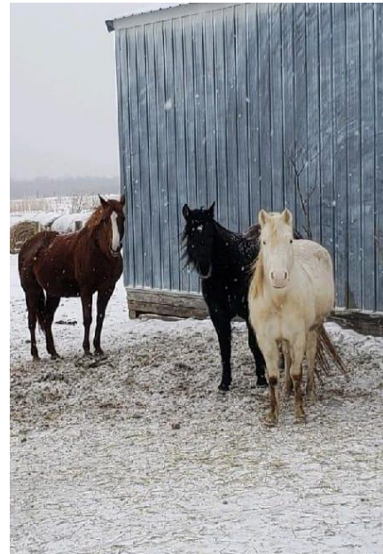
Tweak (sorrel), Jewel (black), KitKat (white) All three mares are showing their baby bumps!!

We are expecting three foals in the spring of 2022. Tweak and Jewel are bred to Chatter; KitKat is bred to Tsuniah Sage Kings Echo.