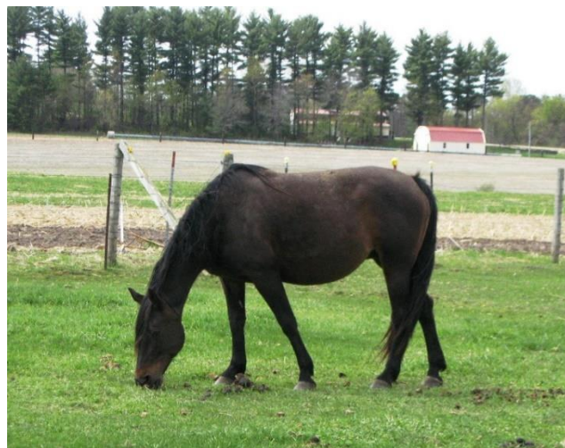
NFF Wilson's Lady Scarlet, aka Rosie. She WAS in foal to Jericho for 2022 but a recent vet check showed she aborted over winter.