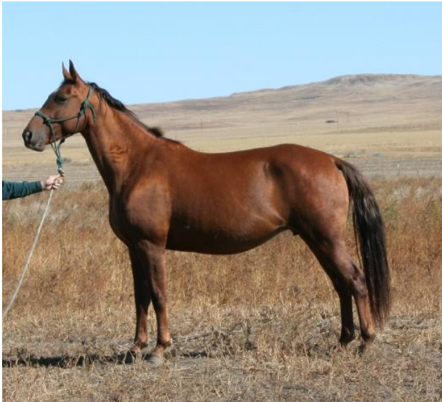
Slush Creeks Kiss This (Slush Creeks Jubal S Slush Creeks Kiss This (Slush Creeks Jubal S X Dakota Miss Eagle) is a level 1 IHWHA chestnut mare. Katy is not bred this year. She is 15.2.