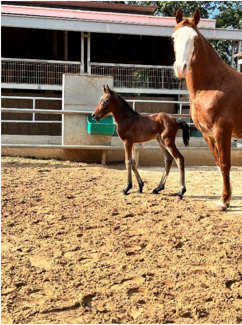
Foal sired by Trump Card out of Ostella's Crystal Gail