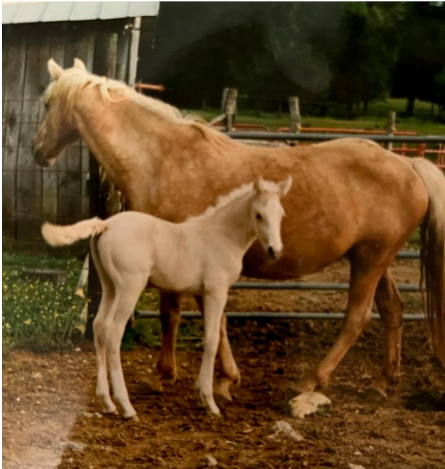
Gold Before The Storm with Tanasi Gold

I had waited so long for that Red Bud's Rascal golden filly, one more try sounded like a plan. And in late May of 1997, I looked out the kitchen window when preparing breakfast to notice that Stormy had grown an extra pair of legs. It was a damp, misty morning, hard to tell much from the house to the colt lot. I walked out, and discovered that my ten-year wait had ended. The golden filly had been named long ago. She would be Tanasi Gold. The conditions on the morning of her arrival gave her the barn name of Misti.