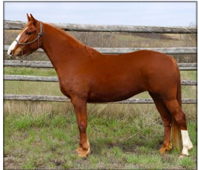
SCW Little Rascals Darla (The Little Red Rascal X Zephyr Dakota Breeze) is a Level 1 sorrel mare. Darla is not if foal this year. Darla is 15hh.