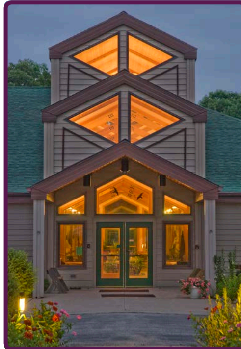
Prairiewoods is sponsored by the Franciscan Sisters of Perpetual Adoration.

Prairiewoods Franciscan Spirituality Center is an ecospirituality retreat and conference center in the Franciscan tradition. It is located on 70 acres of woods and prairie on the outskirts of Cedar Rapids, Iowa. Prairiewoods offers a variety of programs and retreats, as well as conference space to rent. Please join us for an enriching experience in this relaxing, nurturing environment!