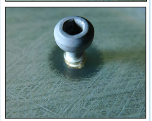
The Galvanis® coating is designed to create a large zone of inhibition around implantable medical devices such as orthopedic bone screws.

What the Experts Are Saying about the Disruptive Antimicrobial Technology Platform, Galvanis®, from Silver Bullet Therapeutics