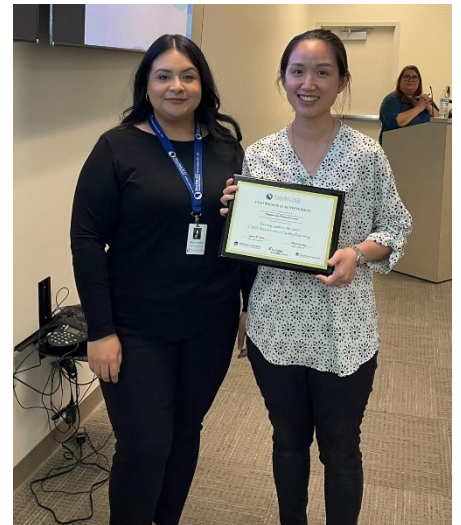
Pictured Sagebrush Medical Center ->