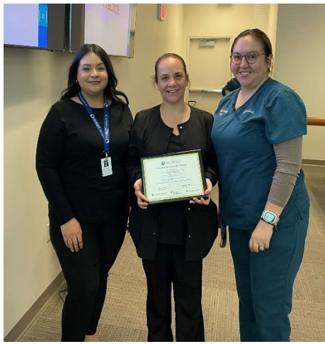
Pictured above Premium Family Practice