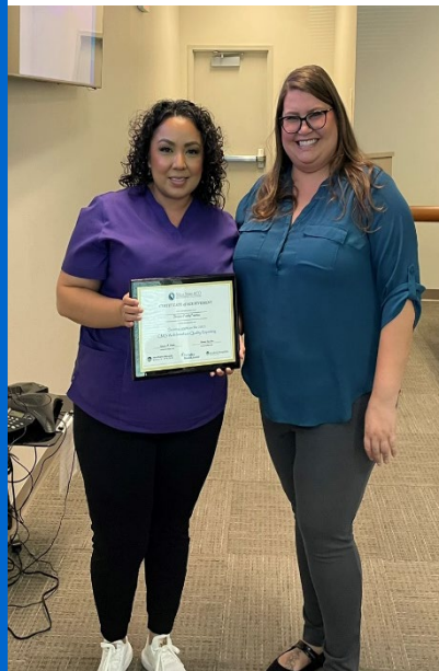
<- Pictured Dectaur Family Practice