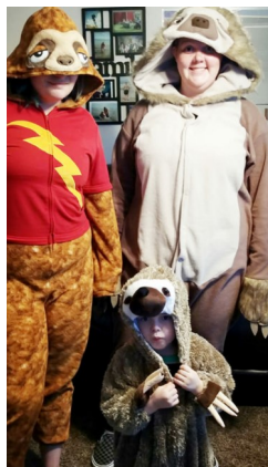
The Sloth Family