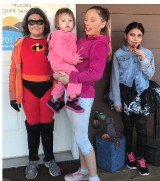
An Incredible & Family