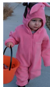
Cute Cudley Baby