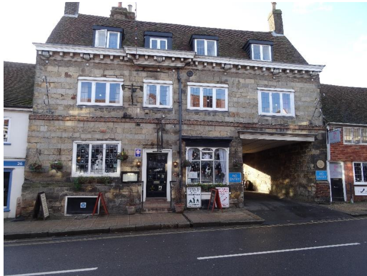
The Bull Inn

A bit further down the High Street is the Bull Inn , built in 1688 from ashlar stone salvaged from the kitchen of Battle Abbey - after the Dissolution of the Monasteries in 1538 the Abbey went into private ownership and the stone of the outbuildings was periodically pillaged or sold off for other purposes. The leaded lights are seventeenth century. Look very carefully at the No Entry sign on the right. Carved into the concrete you will see "RCE 1940", left by the Royal Canadian Engineers, stationed here in the Second World War. " Battle at War 1939-45 " (Price £8.50) can be purchased from the Museum or from Rother Books on the other side of the road.