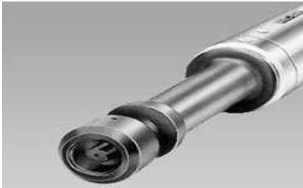
Fig (b):- Shaft

3. Shaft — A shaft is rotating machine component, usually circular in cross section. The shaft is used to transfer the power from one part to another part. The members like pulleys and gears re mounted on the shaft.