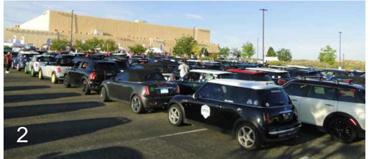
Photos 1 & 2- Cars lined up at the start in Santa Fe.