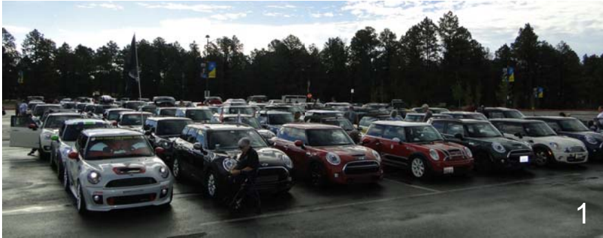
Photos 1 & 2- Cars arriving and getting lined up at the Sky dome in Flagstaff.