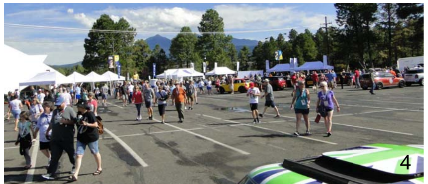
Photo 4- Getting ready to leave after a few last words.