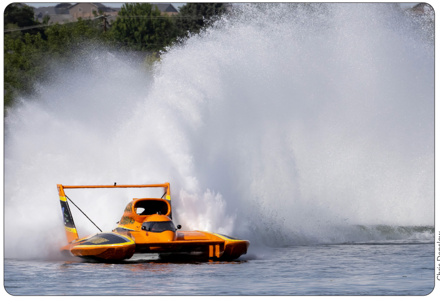
Dave Villwock in the cockpit of the U-40 Miss Beacon Plumbing at the test session in early June. The Swami says it will be a threat to take it all in 2021..

SWAMI SEZ: The sheer lack of consistency over the last few years has kept this