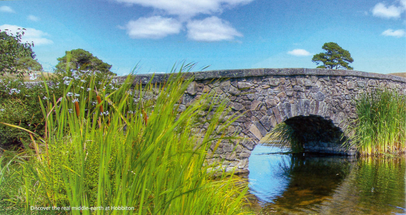
Discover the real middle-earth at Hobbiton