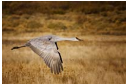
Bosque Flyover - 27 Nancy Naylor