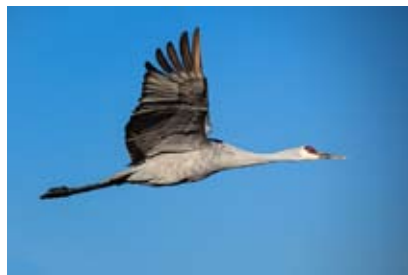
A Smooth Flight - 26 Rose Epps