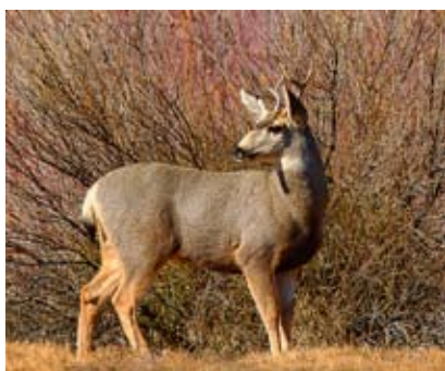
Bosque Buck - 27 Linda Sheppard