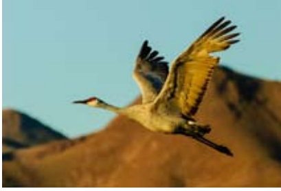
Sandhill Crane in Flight - 27 Beverly McCranie