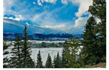
Snow in the Rockies - 26 Leslie Ege