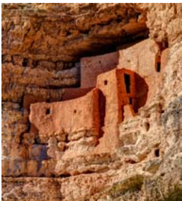
Montezuma Castle - 27 Paul Munch