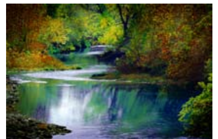
The San Marcos River at Luling - 27 Pete Holland