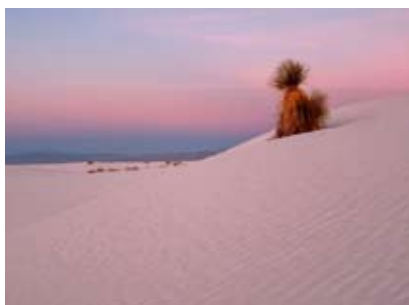
Solitude at Sunset - 27 Jane Kelley