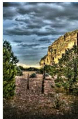
Water Canyon - 27 Brian Loflin