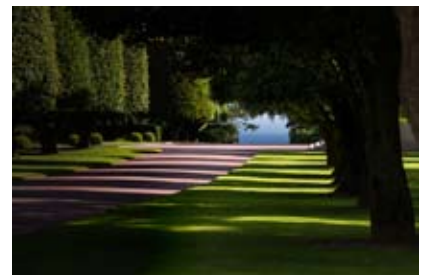
Path to the Sea - 27 Sheldon Lloyd