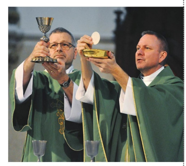
DEACON, AT LEFT

Unlike transitional deacons, permanent deacons can be