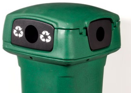
Can/Bottle Recycling Door Inserts (Inserts sold in packs of four) (60-Gallon Only)