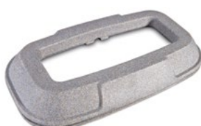
Open Top (ROL21)