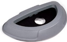
Can Cutout (HCC21)