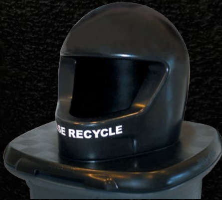
Motorsports Helmet Lid