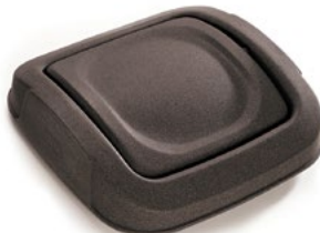
Swing Door (SSD25)