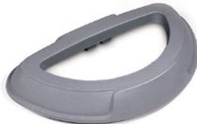
Open Top (HOL21)