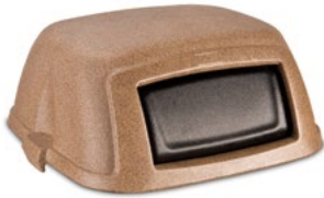
Dome Top with Swing Door (STL50)