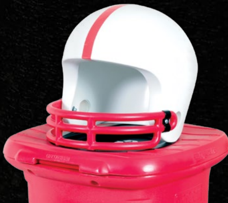
Football Helmet Lid