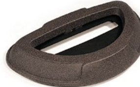
Document Slot (HDS21)