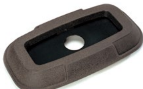
Can Cutout (RCC21)