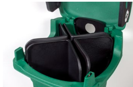
Can/Bottle Recycling Rigid Liners (Sold as four 15-gallon liners) (60-Gallon Only)