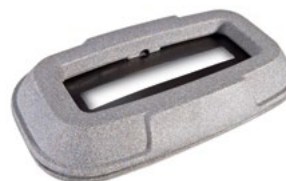
Document Slot (RDS21)