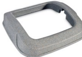
Open Top (SOL25)