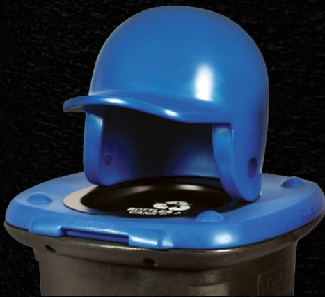
Baseball Helmet Lid