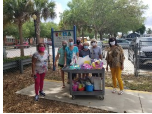
RCMA Easter Baskets