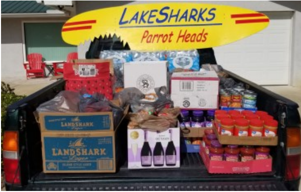
Veterans Food Drive