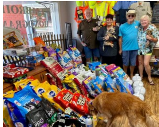
Pawsitive Effects Pet Care Products