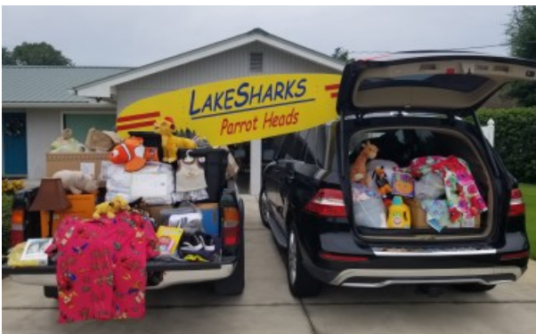
Peace River Women's Shelter