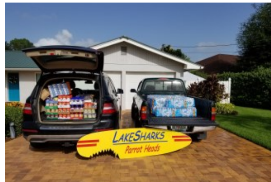
Heartland Food Bank