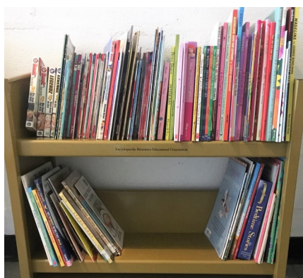
Hempstead Food and Services Boutique receives the LICC's second installment of books for our youth and adult Neighbors

Thank you to TheBookFairies.org for all of your support in helping the LICC to support our Neighbors.