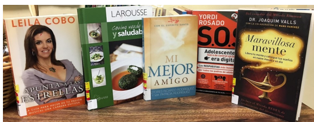
Riverhead Food and Services Boutique receives the LICC's first installment of books for our Hispanic Neighbors.

The two groups are seeking donations of books for children and adults, including foreign language editions.