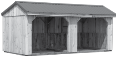
Deluxe Run-In Sheds