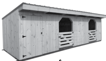
Economy Tackroom Barns