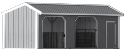
Deluxe Tackroom Barns