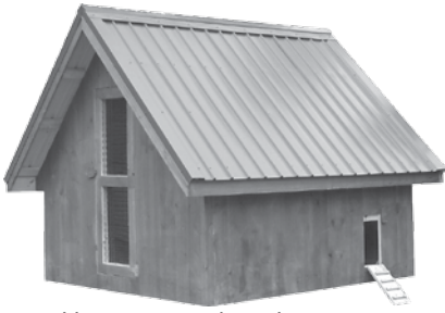
Walk-In Chicken Coops