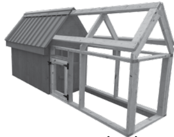
Mini Attached Runs