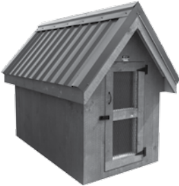
Mini Chicken Coops