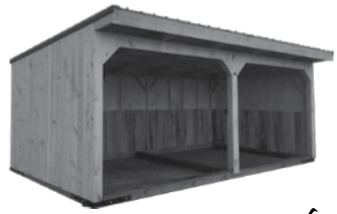
Economy Run-In Sheds