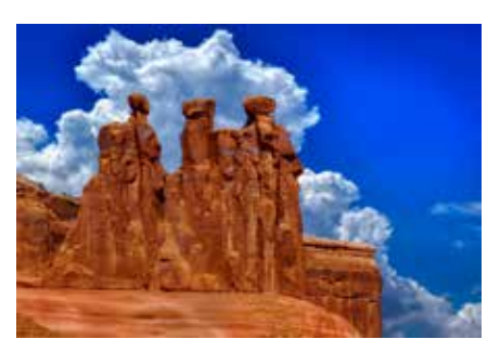
The 3 Gossips - Arches NP, Utah - 10 Matti Jaffe