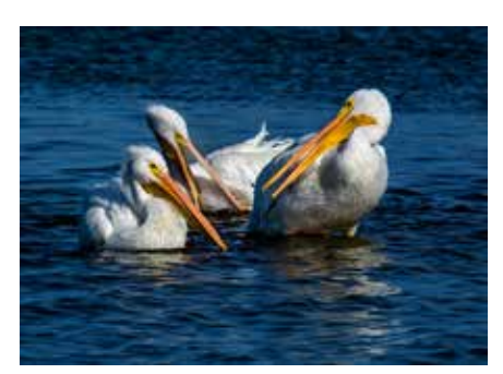
Three Amigos - 9 Beverly Lyle