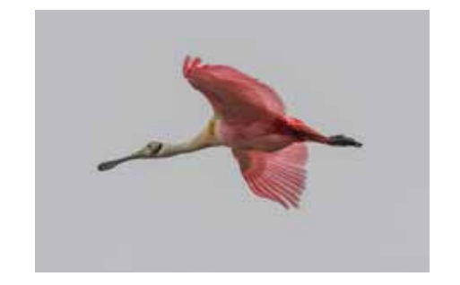
Roseate Spoonbill - 9 Beverly McCranie