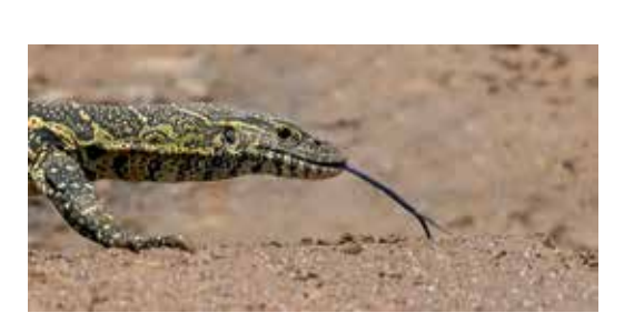
Looking for Lunch - 9 Joyce Bennett