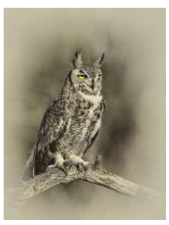
Antique Great Horned Owl - 9 Paul Munch