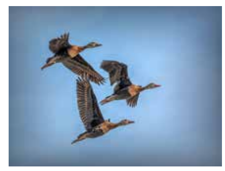
Whistling Duck Trio - 10 Rose Epps