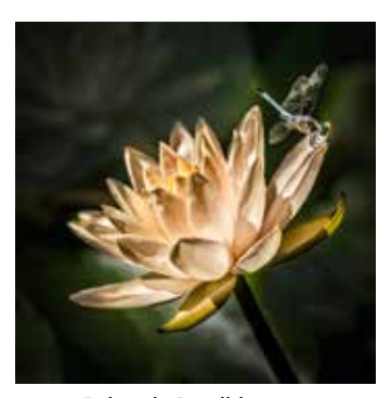
Painterly Rendition - 10 Kushal Bose