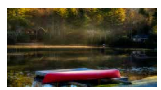
Foggy Sunrise - 10 Phil Charlton