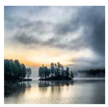
Foggy Sunrise in the Black Hills - 10 Cynthia Fell