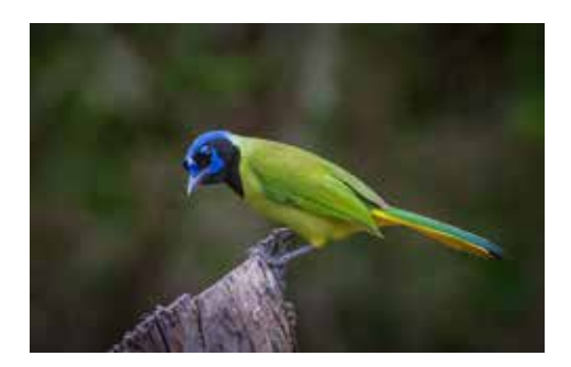
Green Jay - 10 Rose Epps