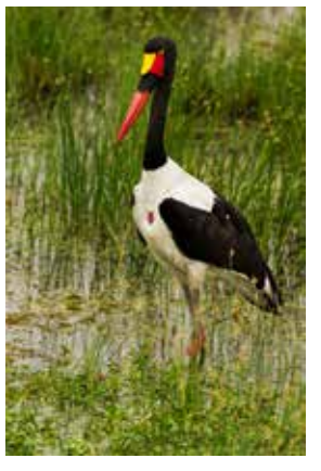
Tux - 9 Dan Tonissen