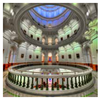
Texas Capital, Second Floor - 9 Pete Holland