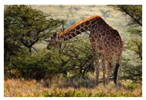
Mane Light - 10 Dan Tonissen