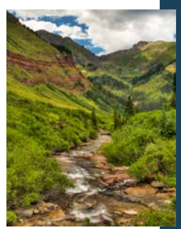
San Juan Mountains