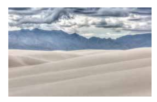
White Sands - 10 Haytham Samarchi