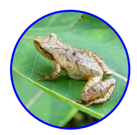
Click on this photo of a Spring Peeper to hear their familiar chorus.

The tails begin to shrink, lungs and eardrums develop and skin grows over the gills. They have reached adulthood. The series of changes in the frog's body form as it moves through its life cycle is called metamorphosis.