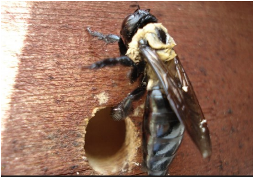
Carpenter Bees can cause serious damage to your external wood structures.