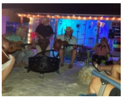
Late Night - Early Morning on the Beach