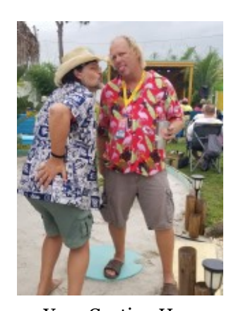
Your Caption Here