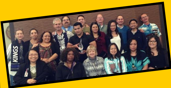
The WCC Staff

"To provide a safe and nurturing environment for each individual to achieve their vision of recovery while promoting acceptance, dignity and social inclusion"