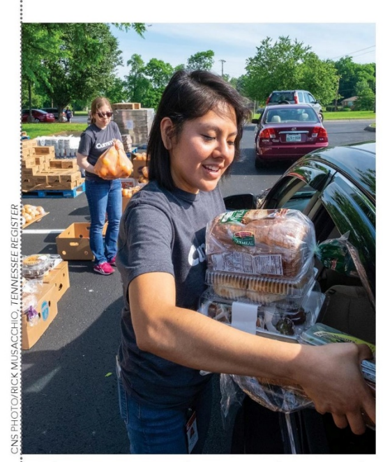
In the poor, Jesus is with us. Here, volunteers work at a food pantry in Nashville.

Before the resurrection, Jesus likely would have suffered the ravages of illness and lack of proper nutrition that all the people of his time were subject to. After the resurrection, Jesus showed he was exalted with the very power of God. Even his physical appearance had changed.