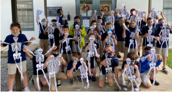
The 4th Graders made skeletons in the library