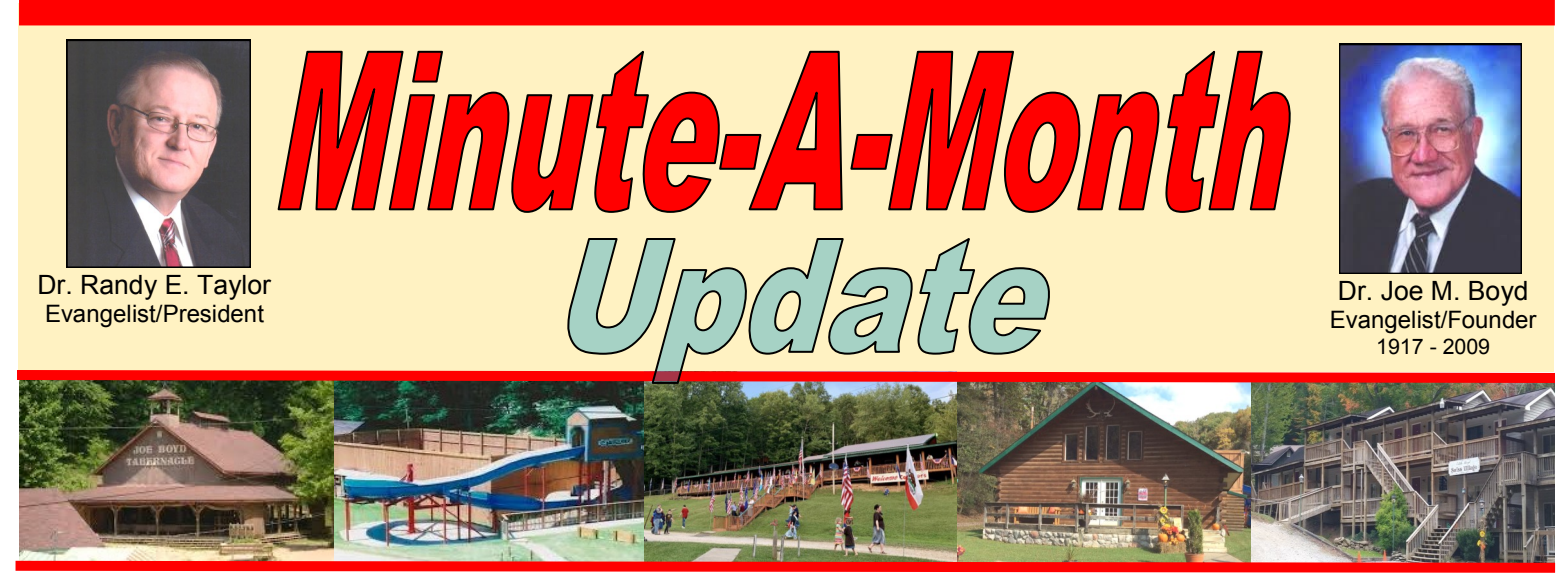
Update is a monthly letter sent to the friends and supporters of Mt. Salem Revival Grounds.