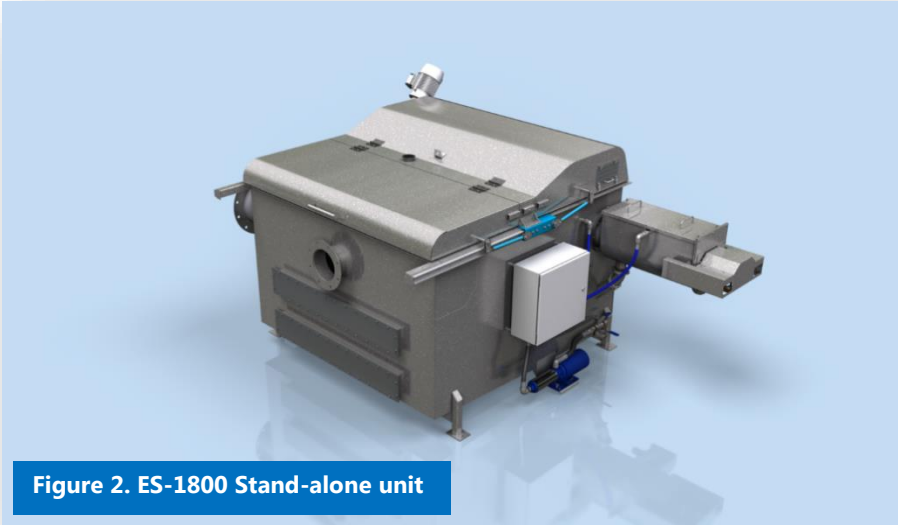
Figure 2. ES-1800 Stand-alone unit