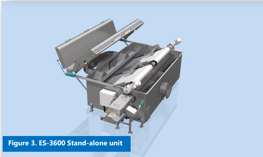
Figure 3. ES-3600 Stand-alone unit