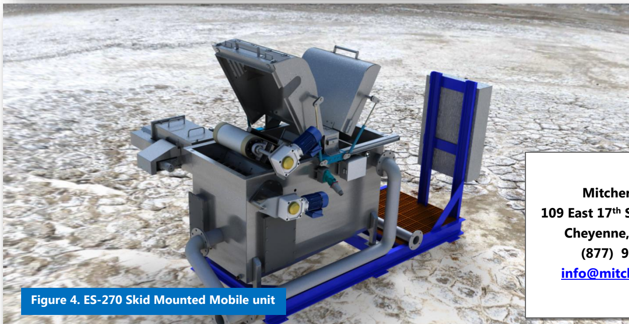
Figure 4. ES-270 Skid Mounted Mobile unit

The Mitcherson EcoSieve Models ES-270, ES-940, ES-1800 are single belt machines. The ES-3600 is a duplex arrangement with 2 belt assemblies installed in one housing with one solids collection system. The EcoSieve can be provided on a pre-wired skid mounted platform which can drastically reduce field installation cost. Our skid units can be mobile stand-alone units ready for deployment.