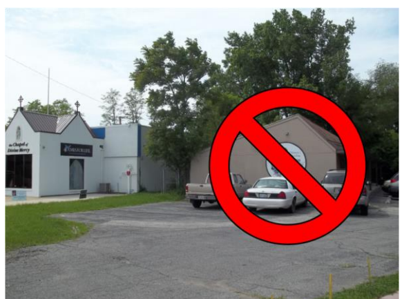
Temporary Closure of the Abortion Clinic