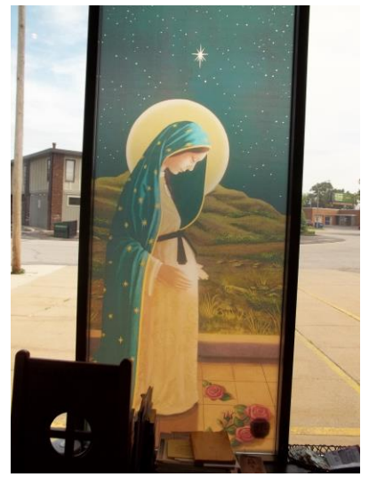
Our Lady in the chapel window

Apostolate's TLC ("The Life Center") Advocates, found them to be substantiated and was therefore: