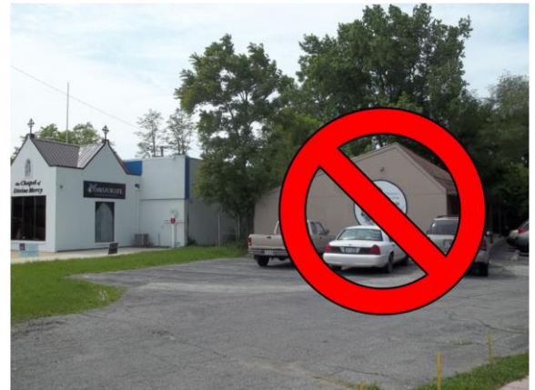
Temporary Closure of the Abortion Clinic