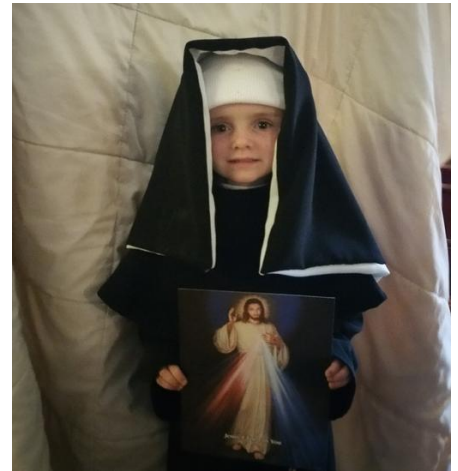
Perhaps a future novena to St. Faustina?

As described above, God has granted us many successes in our struggle against abortion; yet the struggle will continue – at least for a while. If we have the resources, human and financial, to put together additional Novenas with Perpetual Adoration we will do so. The Health Department will be ruling on the clinic's application for a new license early in February, and the Medical Licensing Board may finally bring the doctor to trial in March. Can we count on your help?