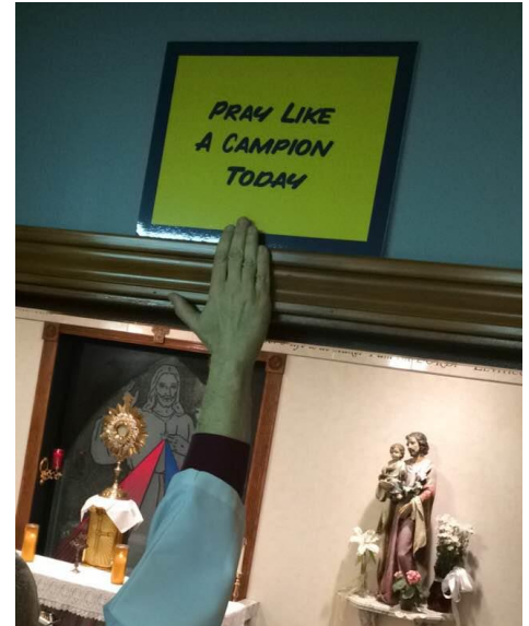
We strive to pray intently and faithfully like St. Edmund Champion

Since the Chapel of Divine Mercy was consecrated in the fall of 2013, we’ve been adoring the Blessed Sacrament during every hour that the South Bend abortion clinic has been open. During the same hours, we have been a constant, prayerful presence on the Prayer Peninsula outside the clinic. Nonetheless, this year we have sometimes felt the need to do more.