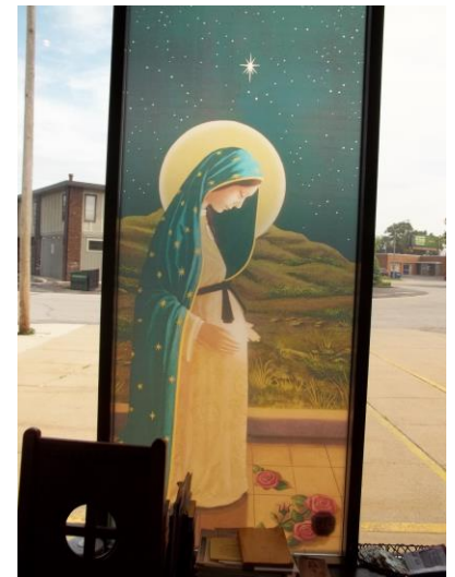
Our Lady in the chapel window