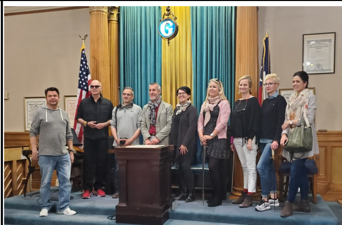
A group of teachers and administrators from the German School of El Paso of the Federal Republic of Germany toured our facilities to learn more about Masonry and the history of Masonry in El Paso. They came bearing gifts of real German chocolate and a yearbook of their school for our library.