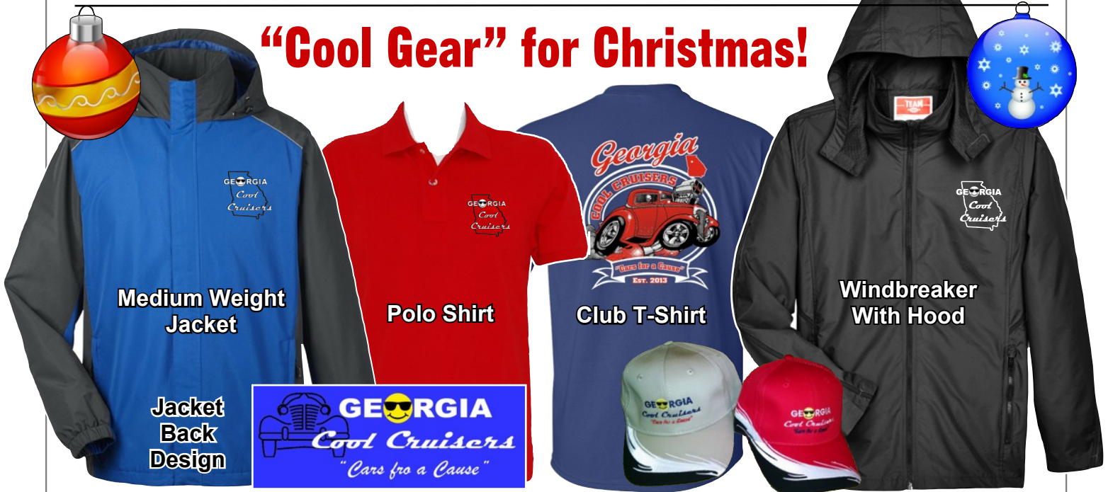
Medium Weight Jacket