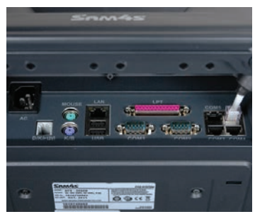
Easy to Access Ports Connect to a wide array of compatible off-the-shelf POS peripherals with six serial ports and two USB ports.