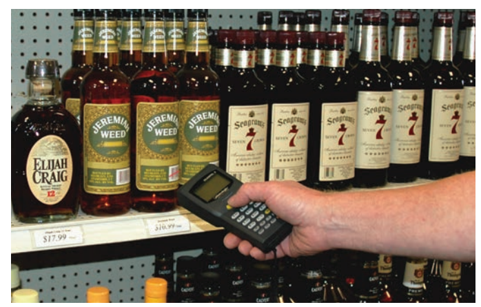
SAM2000 accepts inventory receipts and inventory updates from popular handheld portable data terminals.