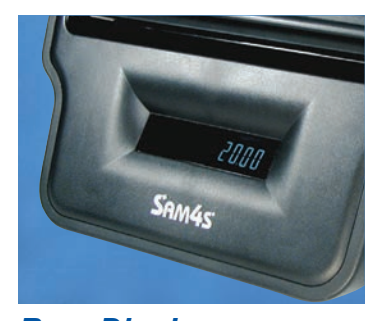
Rear Display The rear display allows consumers to monitor prices as items are entered and view the sale total.

Each SPS-2000 includes a magnetic card reader and a rear customer display. These essential components are significantly more expensive when added on to a bare-bones terminal.