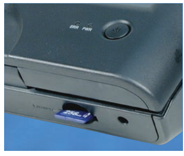
Easy Save/Load Store programs or collect reports with the SD memory card port or USB port.