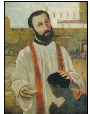
Feast Day: September 9

After four years of sickness, which forced the saint to remain inactive and largely neglected, Peter Claver died on September 8, 1654. He was canonized in 1888, and Pope Leo XIII declared him the worldwide patron of missionary work among black slaves.