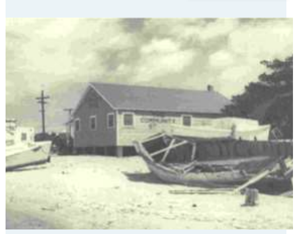
The Community Store entrance from the harbor, before the storage room moved to this end.