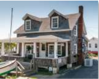
William Ellis Williams House, ca. 1900