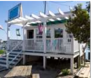
Electric Office, ca. 1936