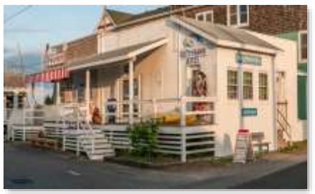
Generator Plant, ca. 1936