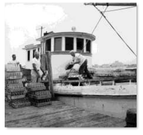
Top: The Community Store; The mail boat 'Aleta'; Hauling ice at the generator plant; 'The Bessie Virginia' freight boat.