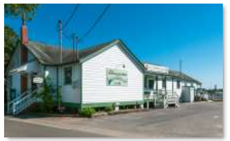
Community Store: Rebuilt in 1950 after storm of '44.

"OFI's multi-faceted approach to the preservation of special places like the Community Square serves as a sustainable model for other rural communities, where the potential is great but the funding is limited.