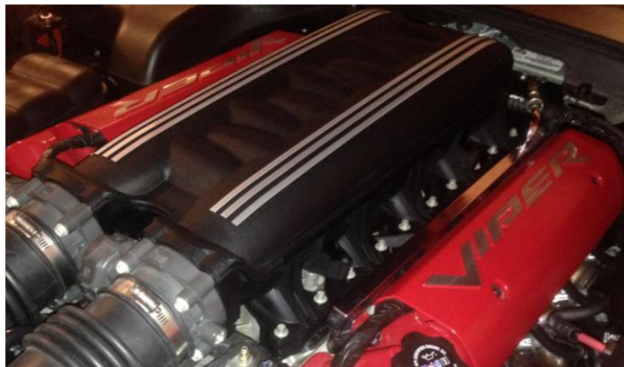
Gen V manifold installed using DSE Compression Limiters

The DSE compression limiters allow the Gen V composite intake manifold to be bolted directly to the Gen IV heads without modification of the supplied Gen V compression limiters or heads.