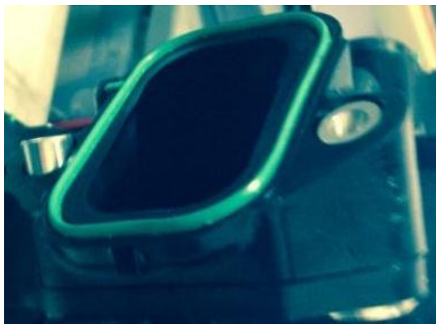
OEM Compression Limiter (Left) vs DSE Limiter (right)