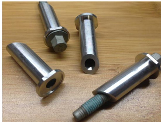
Compression Limiters (shown without anodized finish)

http://dougshelbyengineering.com/Viper.html SRT-10 Gen V Intake Manifold Compression Limiters P/N: DSE-VP-CL-001