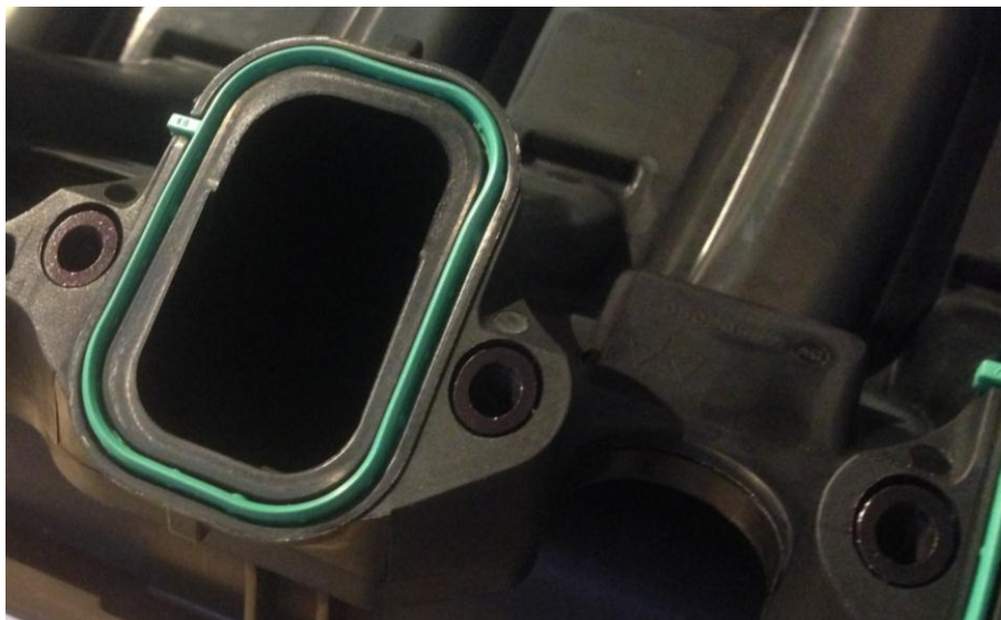
Proper alignment of Compression Limiters