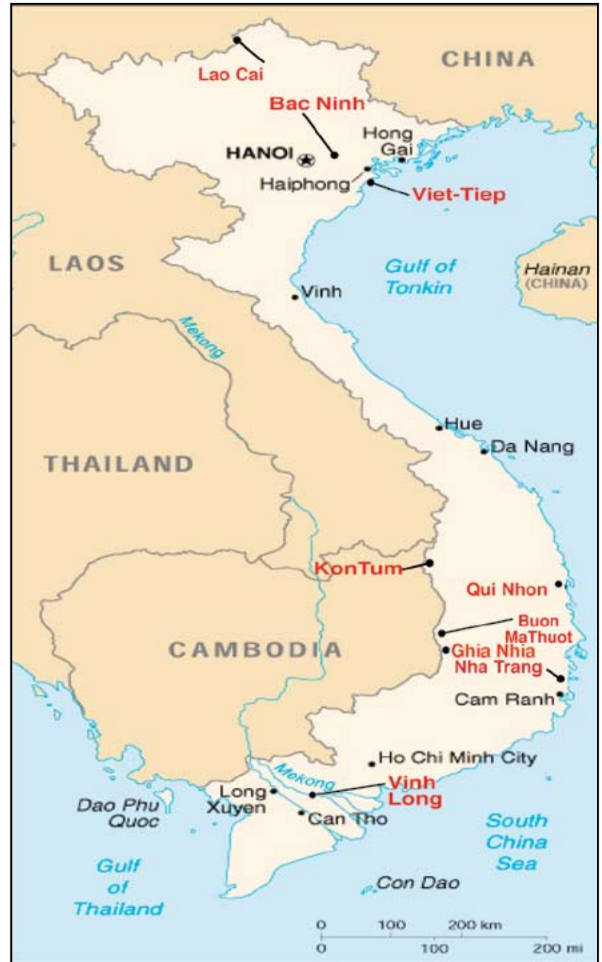
MILPHAP has established surgical training programs in the cities indicated in red.

and found that they were very receptive to receiving help, as far as medical technology and education. I met with the medical directors of 2 province hospitals in Buon Ma Thuot and Nha Trang and proposed setting up an organization to aid these areas as far as medical education, equipment, books, computers and onsite instruction of surgical techniques. I also visited orphanages and remote