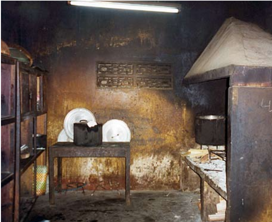
Kitchen of orphanage. Food Budget for orphanage is $6/month for each child.