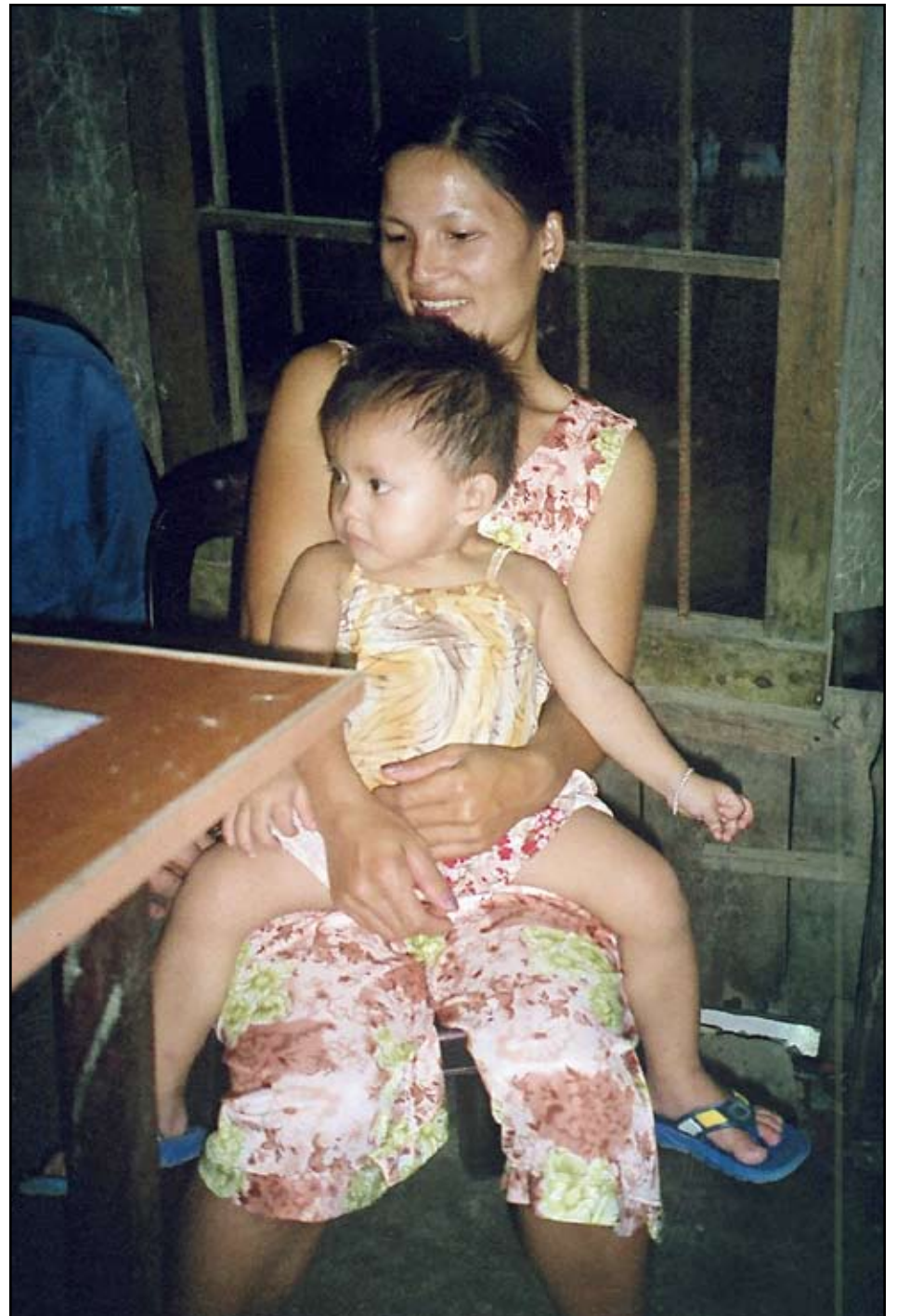
Same child at 2-years-old.