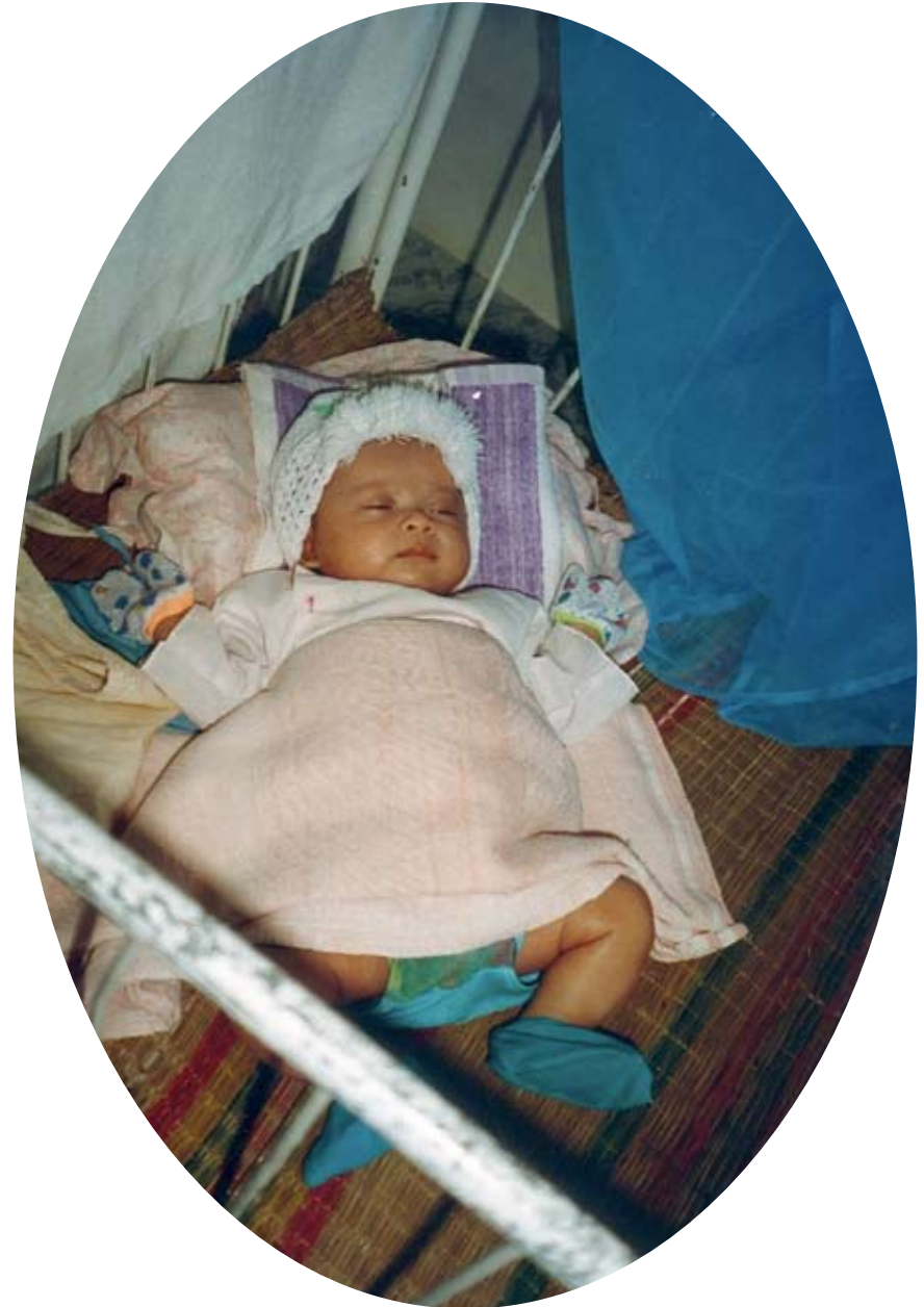
Newborn orphan in Nha Trang.

Thousands of patients have been treated with the benefit of the surgical equipment and training that we have provided to remote hospitals in Vietnam and I feel privileged to have been part of this. None of this would have been possible without the help of my friends in the medical community and without your help.