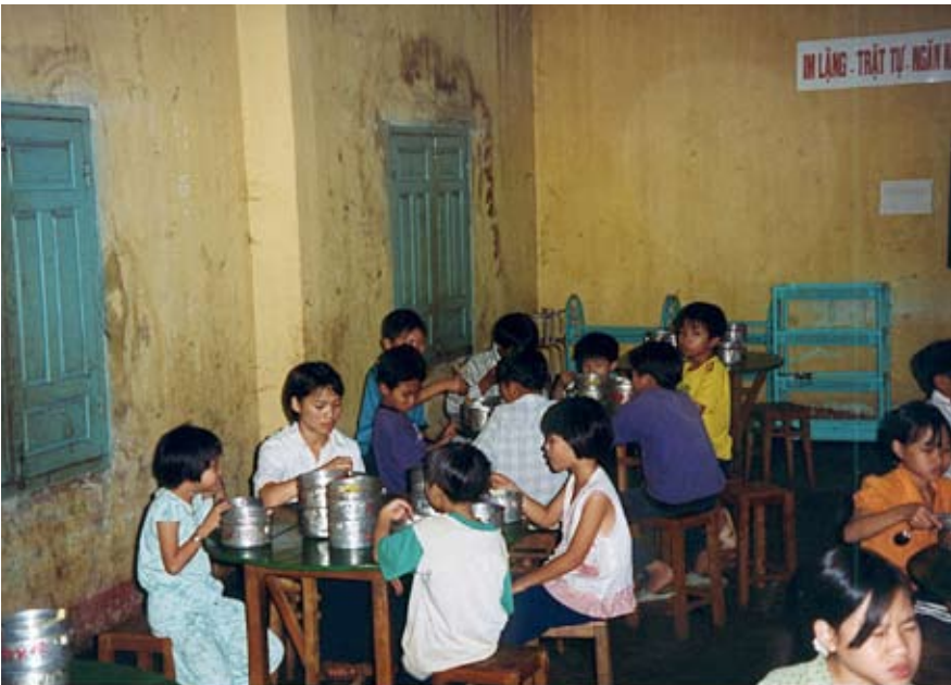
Orphanage in Buon Ma Thuot.