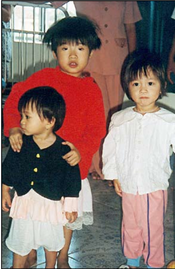
Children in orphanage in Nha Trang.