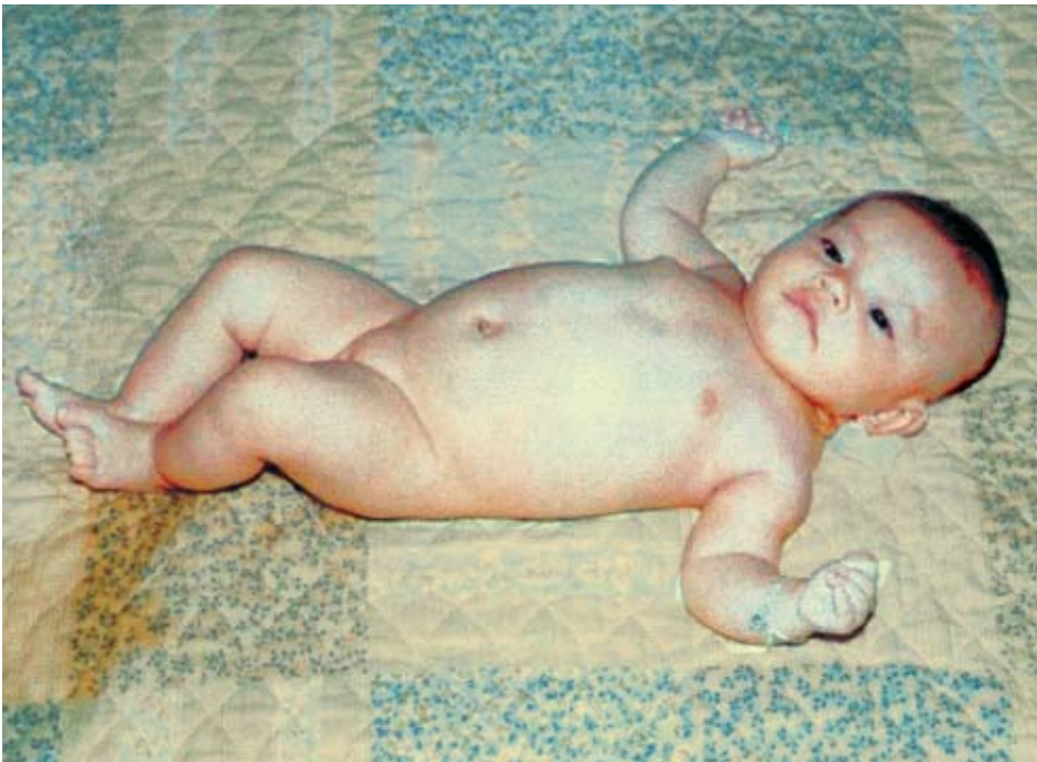
3 months later, after a successful surgery in Ho Chi Min City paid for by MILPHAP-19.