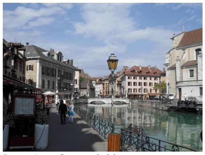
River in Annecy flowing to the lake.

Packing our new purchases and smiling faces into the bus, we left the beautiful Annecy as the clouds rolled over the mountains.