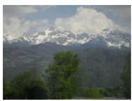
French Alps from the bus