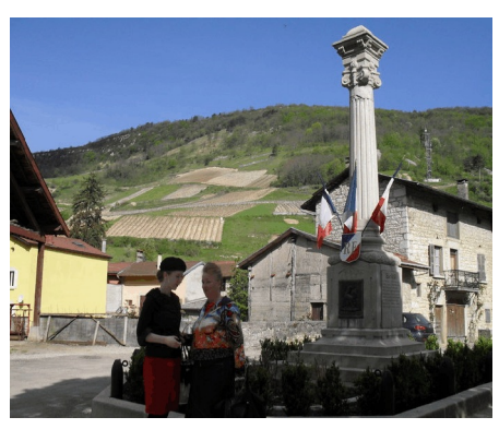
Cerdon. (Vineyards on mountainside.)

Our first stop was La Cuiverie de Cerdon, the copper factory that has been in business since 1854. There,