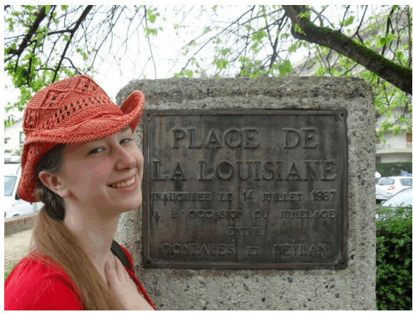
The "Louisiana Plaza" ~ dedicated to Gonzales. Bottom line says "Gonzales et Meylan".