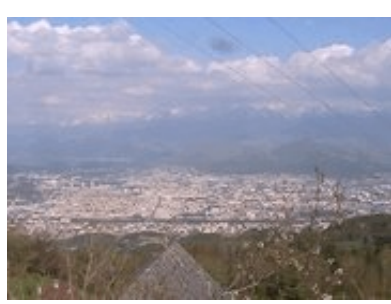
Cities of Grenoble/Meylan as seen from the monastery.