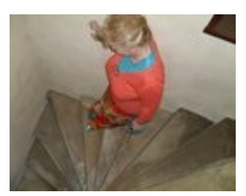
Every inside staircase was circular.