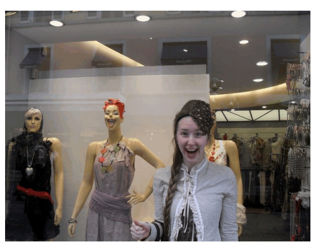
Great mannequins in Annecy!