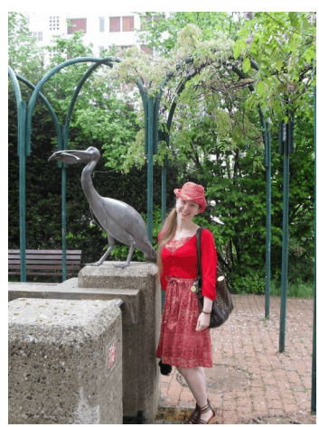
Pelican fountain at the entrance to the "Louisiana Plaza"