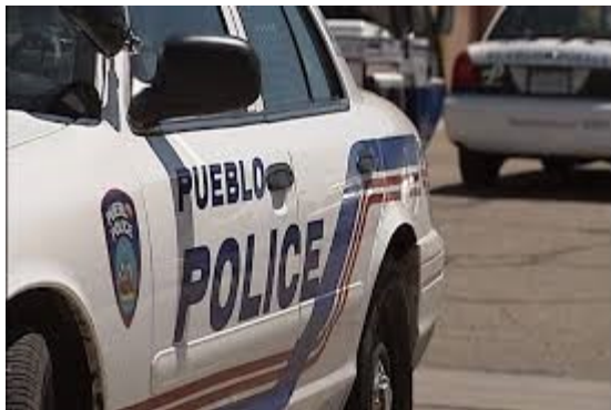
We began POI with the Pueblo Police and Sheriff's Departments