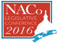
Winter Reception - Washington DC February 22, 2016