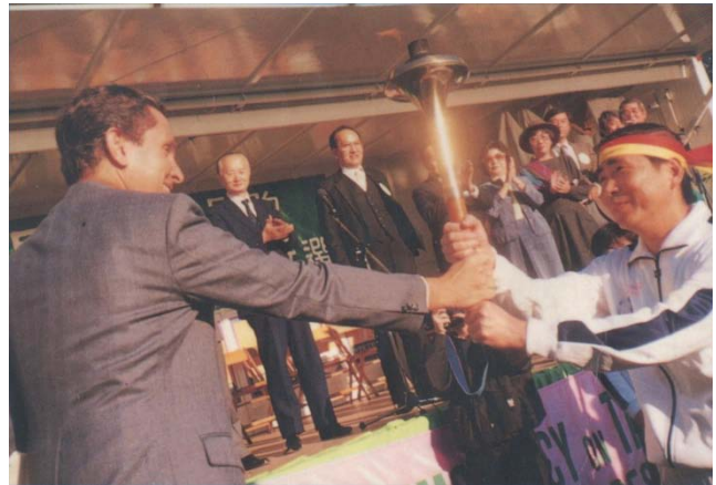
Democratic Torch Long Run from NY to Taiwan, 1987