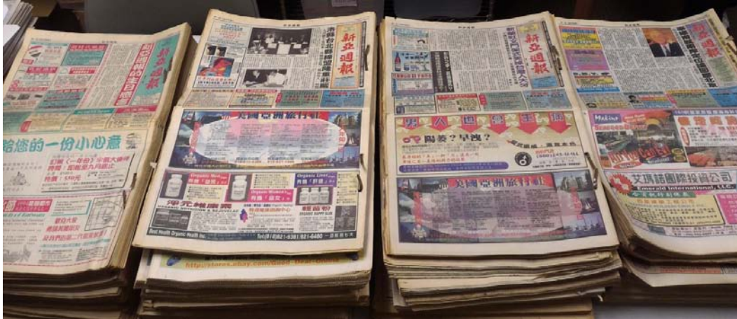
889 issues, 17 years of New Asia Weekly (新亞週報)