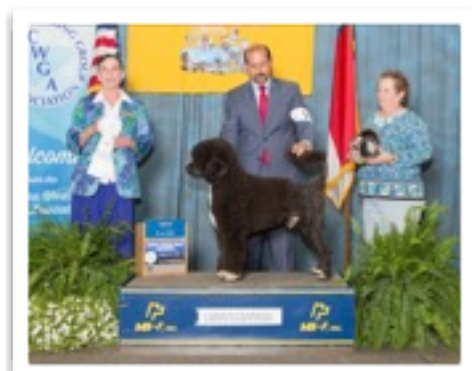
Group 4 GCHG Seaworthy's Plan of Attack CGC