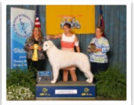
Group 3 CH Ederra's Glacier The Power Of Mo'Ne