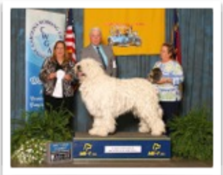
Group 4 GCH Meadow View Wildcard