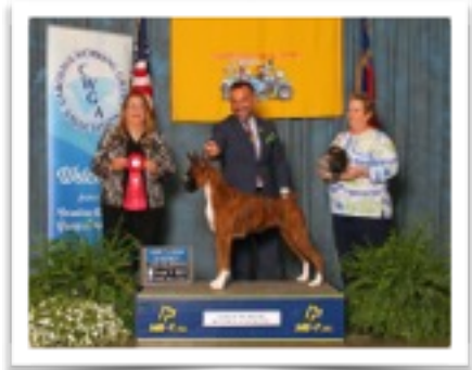
Group 2 GCH Mephisto's Speak of the Devil