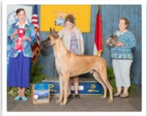
Group 2 GCHB Lagarada Danehills Star Struck Titan