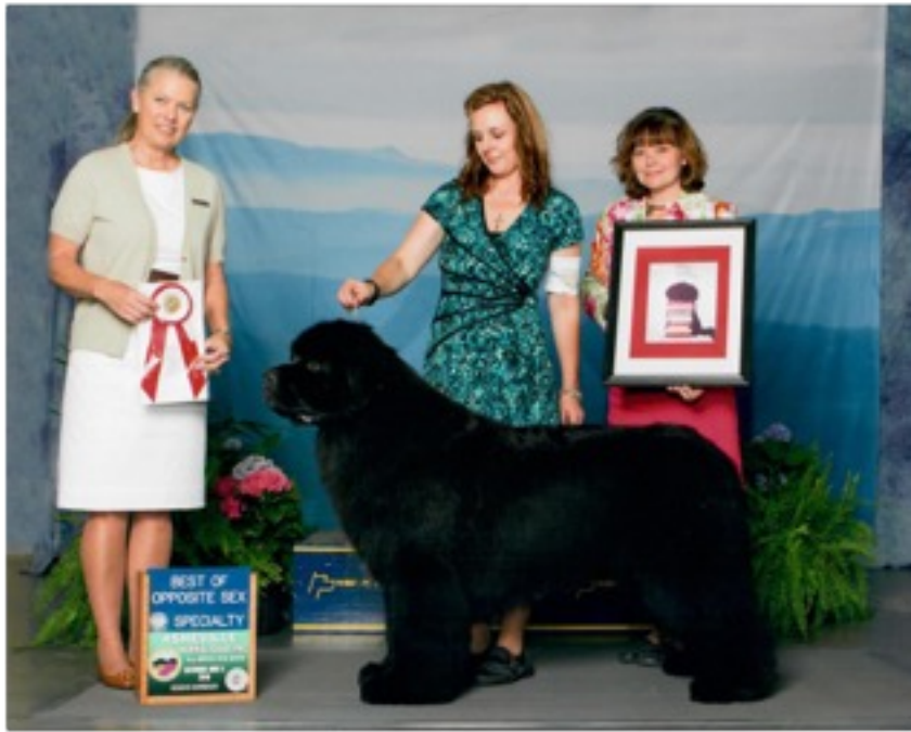
Best of Opposite Sex Southeastern Newf Club (SENC) Regional Specialty. June 11