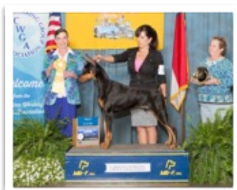
Group 3 CH Legendale Abound of Goldgrove