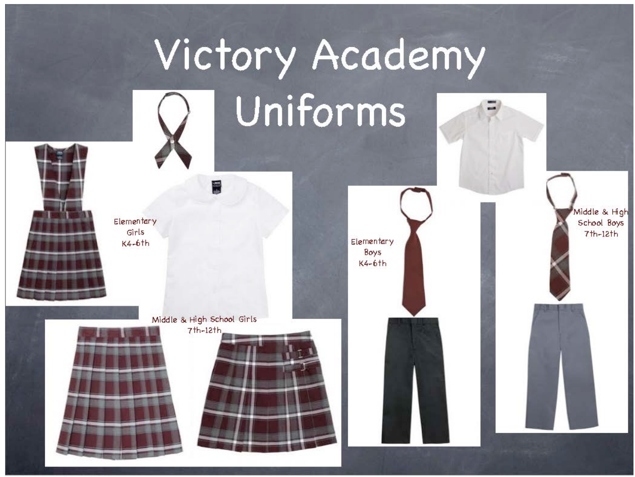
Thursday, December 18, 2014