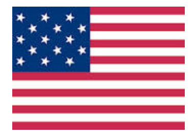
American Flag Pledge

I pledge allegiance to the Christian Flag and to the Savior for whose Kingdom it stands. One Savior, crucified, risen, and coming again with life and liberty to all who believe.